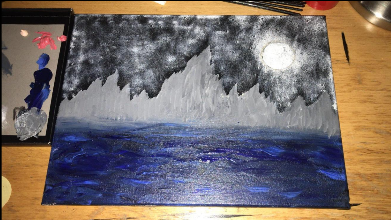
I paint a lot, read books, watch movies &