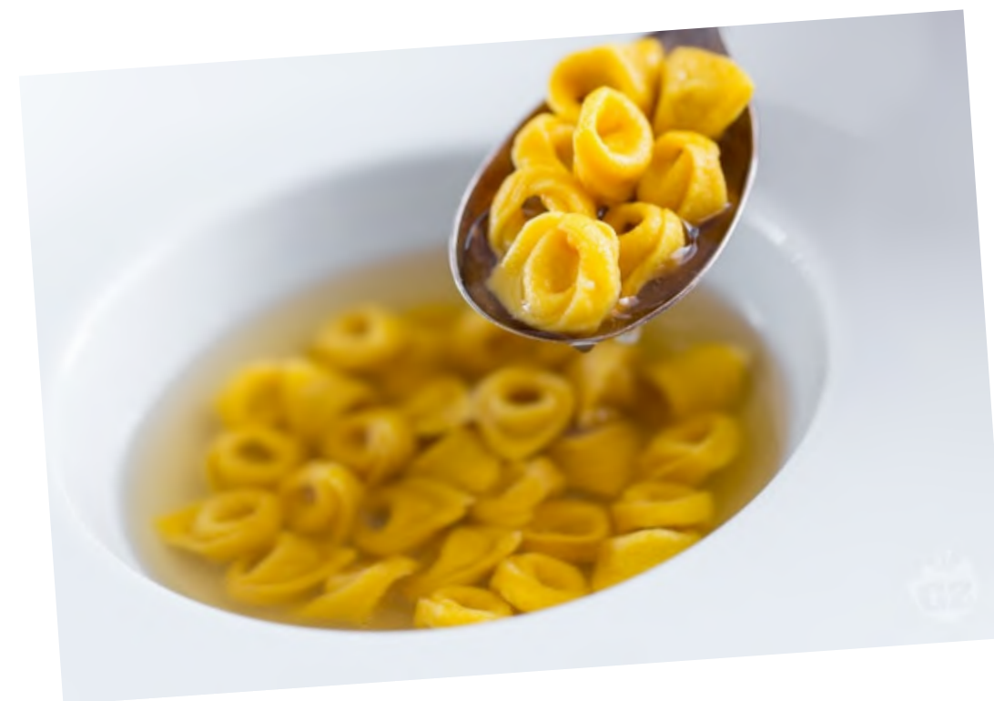
Tortellini in broth