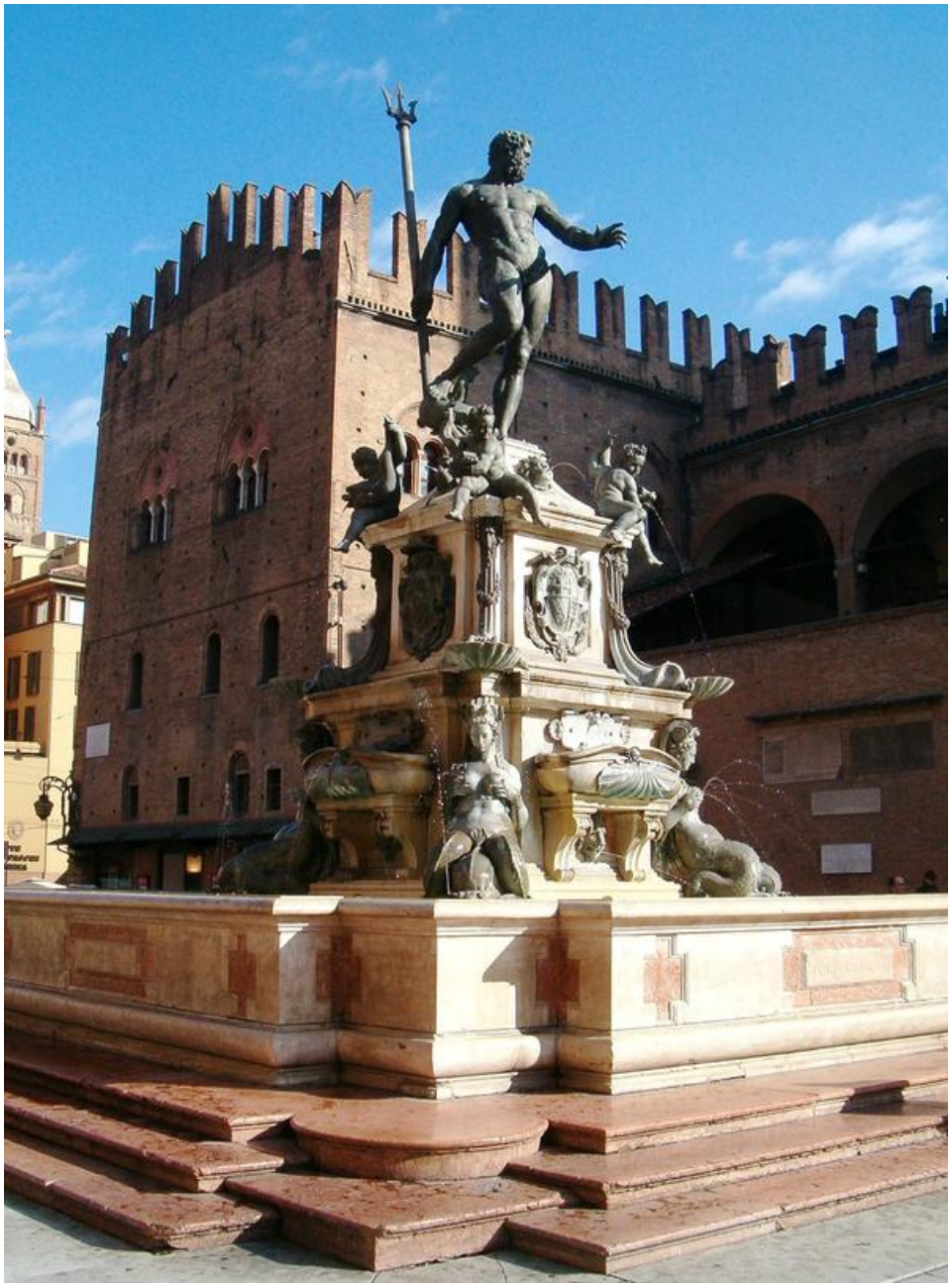
Fountain of Neptune ←