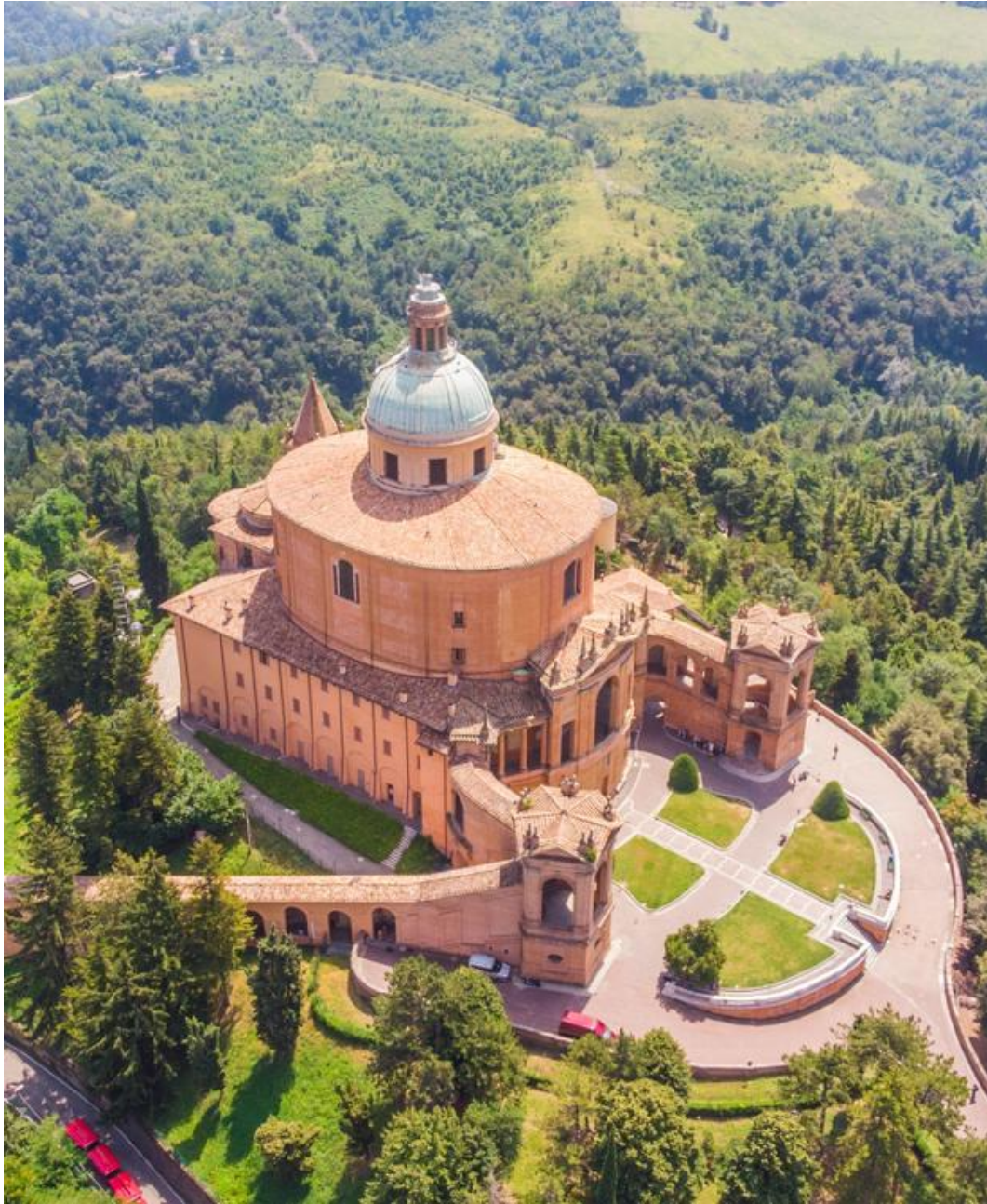
Sanctuary of San Luca