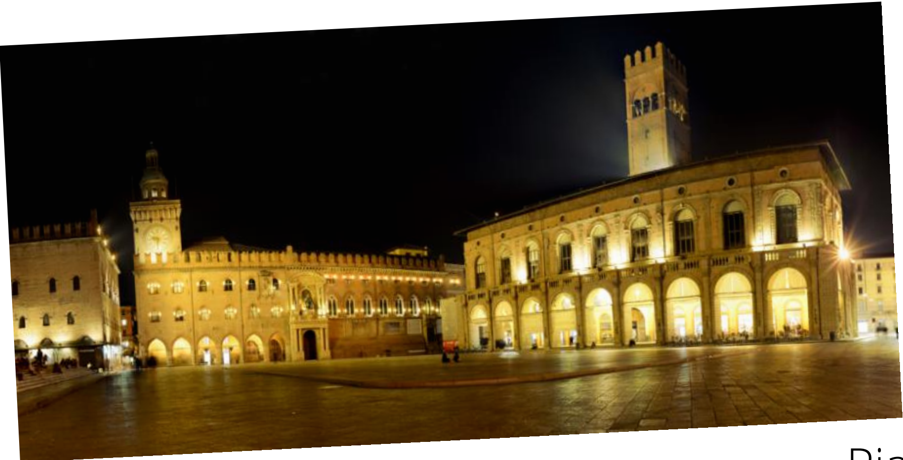
→ Piazza Maggiore