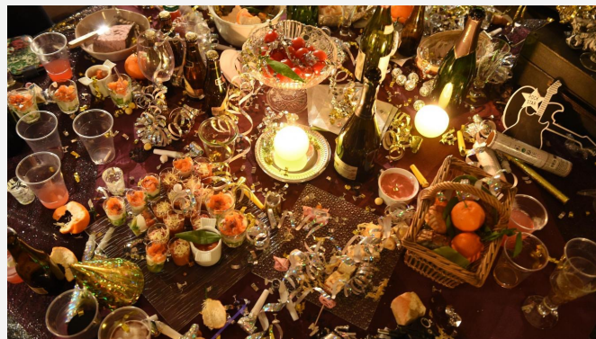
LE RÉVEILLON DE NOËL