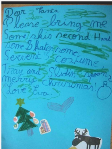
Letters to Santa