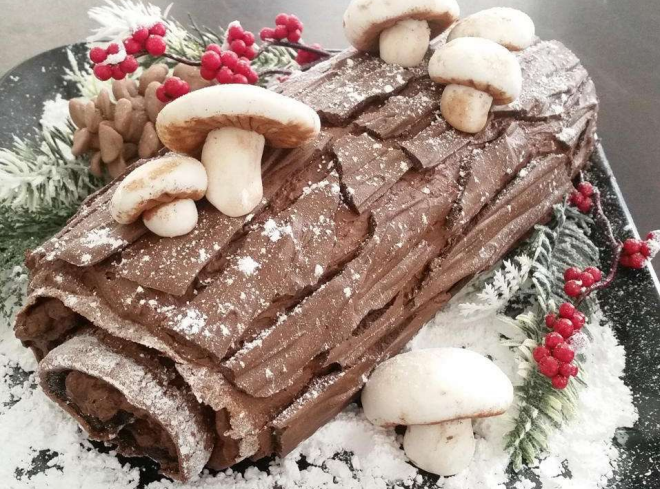
La bûche de Noël