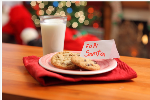
Leaving cookies and milk out for Santa Claus